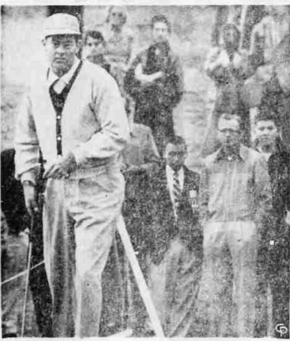
WATCHING HIS PUTT ROLL by the cup in the Los Angeles Open Golf tournament, Dr. Cary Middlecoff shows his discontent and disappointment.