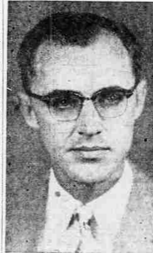
WILLIAM McALLISTER Supreme Court Justice