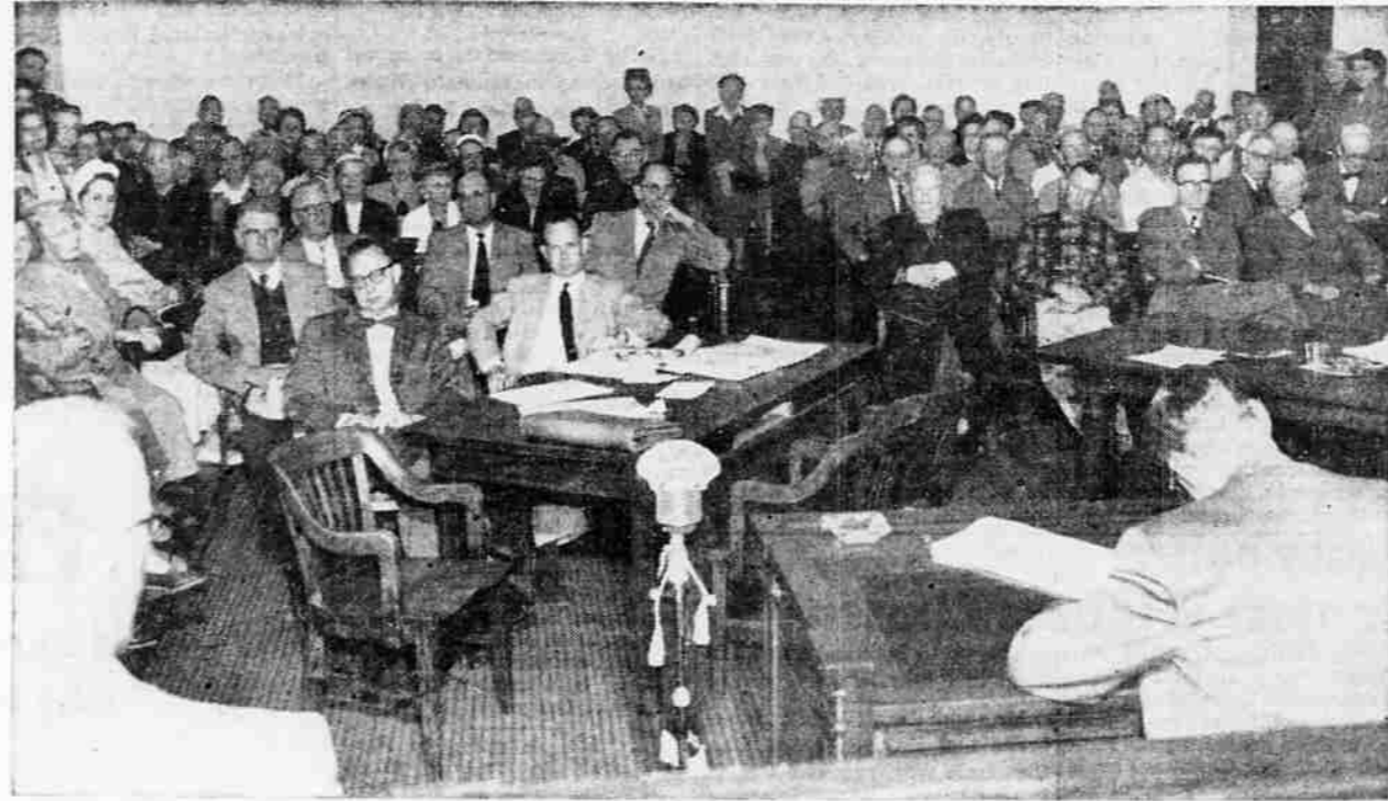
SOUTHERN PACIFIC HEARING Capacity Crowd Hears Testimony