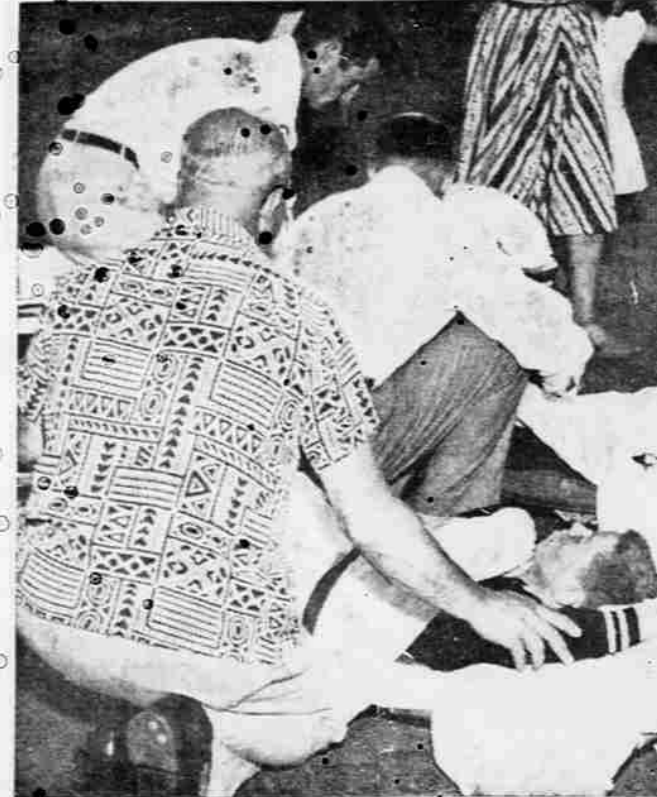
BOY SCOUTS INJURED Returned to Medford