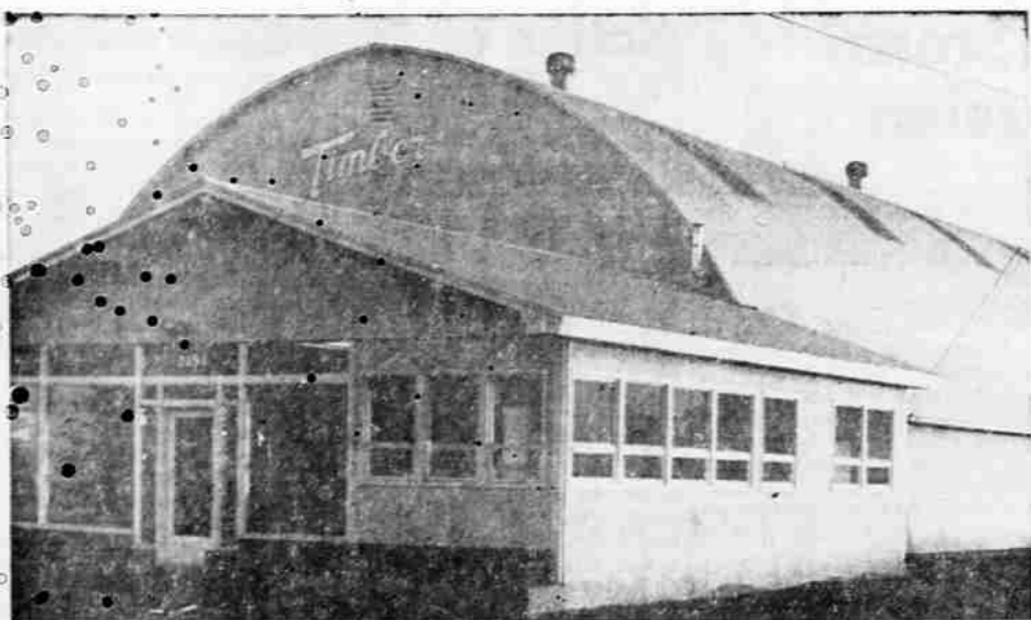
NEW PLANT—Timberib Construction company has moved its office and plant from Grants Pass to the Mason-Ehrman industrial tract north of Medford. The local establish-

ment was opened Dec. 1. The company manufactures and sells pre-cut buildings made from glued laminated wood. It is an affiliate of Timber Structures Inc., Portland.