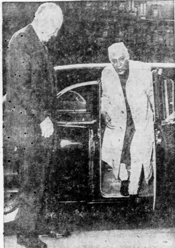
IKE, NEHRU END TALKS —President Eisenhower escorts Indian Prime Minister Nehru from the White House limousine at Blair House in Washington. The two leaders had spent a full day on the President's farm near Gettysburg discussing world problems.