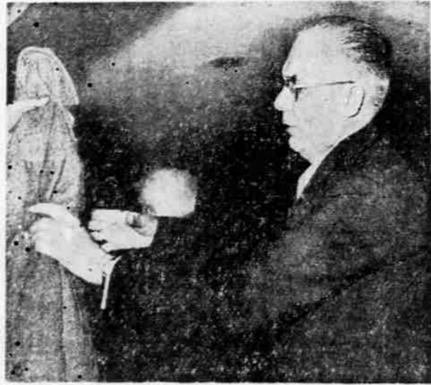
SNUBS UN DEBATE —Hungarian UN delegate Imre Horvath reaches for his coat after his delegation walked out of the General Assembly in New York in protest against consideration of the Hungarian revolt. Horvath made it clear his nation was not leaving the UN itself, but only the Assembly for the duration of the debate.

It meant there would be no further use of Soviet troops for local political purposes. The Soviet armed forces were called