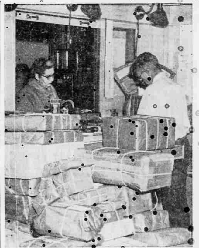
INSIDE LOOKING OUT —From the postman's side of the mailing window in the Medford post office the view consists mainly of heaps of packages, stacked in every corner, as the huge volume of Christmas mail comes and goes. Although it looks like utter confusion, the mail and packages are handled quickly and efficiently by postoffice personnel.