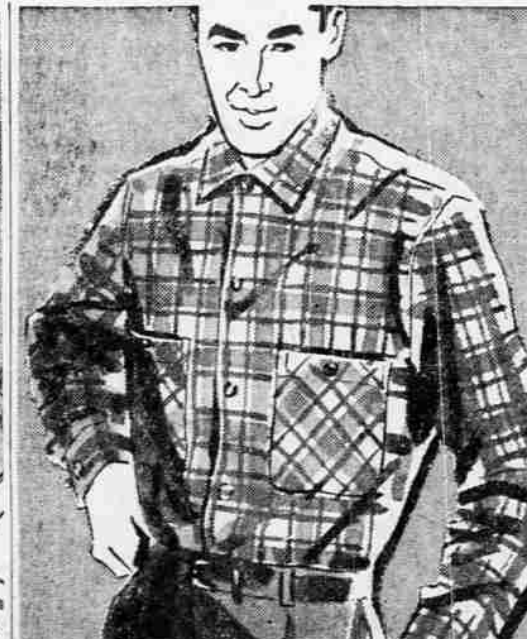
Cotton Flannel Sport Shirts Big Selection

Colorbright winter prints. Heavyweight warm cotton flannel. Pattern cut for fit and comfort. Tailored and middy styles in sizes A, B, C, D. 3.49