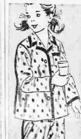
GIRLS FLANNELETTE P.J.s

Fruity nylon, so easy to sunder, quick drying. Lacy and knit trims on long-wearing tricot knit. Sizes 5-M-L. Plain or Fancy Rayons . . . 59c Nylon, pr. 98c