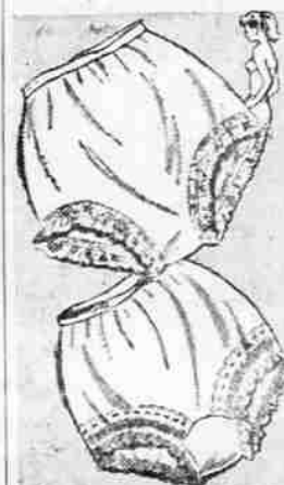
FANCY NYLON PANTIES

Completely washable full length and duster chenilles. Beautiful colors that stay lovely wash after wash. No ironing, just fluff. A gift to give her hours of comfort. 3.98 and 4.98