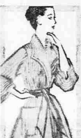
WOMEN'S CHENILLE ROBES

The always welcome gift! Colorful matching Cardigans and Slip-Overs. Closely woven all wool for extra warmth. Sizes 38 to 40. 3.98 and 5.90