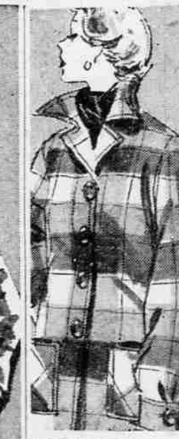
BLOCK PLAID JACKETS

EXTRA HEAVYWEIGHT FLANNEL WORK SHIRTS REDUCED 2.49