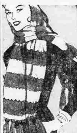
ALL WOOL LONG SCARFS

High twist, dull finish 60-15 glamour sheers with greater elasticity. Dark seams, top fashion shades. 8 1/2 to 11. 98c