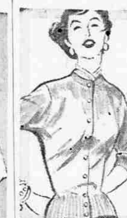
WOMEN'S ALL WOOL SWEATERS

Dacrons, nylons, cottons . . . tailored and frilly styles to delight the most particular woman on your Christmas list. New easy wash quick-drying fabrics. Sizes 32-42. 2.98 to 4.98