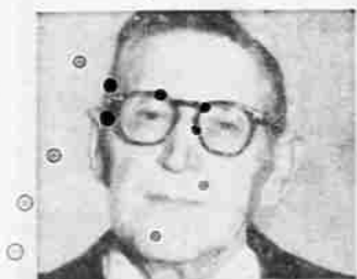
Happy man breaks laxative drug habit

Emphasis is placed on sanitation of order, avoiding sales to gamblers and intoxicated persons, financial assistance pitfalls, standing on duty and proper application procedure when changing ownership or remodeling.