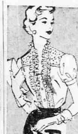
LADIES FANCY BLOUSES

Brighten her holiday with one of the new long length scarfs. Beautiful plaids, colorful plaids in warm all wool with fringed ends. Teen-agers favorite! 1.98