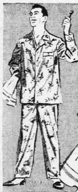
MEN'S FLANNEL PAJAMAS

100% wool flannel splash weaves in tan, grey and light blue. Tailored to a T. Sizes 10 to 20. 24.95