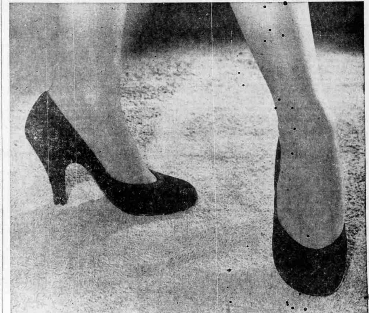
THE NEW EMBRACEABLE — a light, dressy pump by Air Step. The dipped sideline—an important silhouette—with a slender elasticated collar encircling the foot. In all sizes—AAAA to C, 5 to 11. The ideal shoe of holiday festivities, $11.95 at your Buster Brown Shoe Stores.