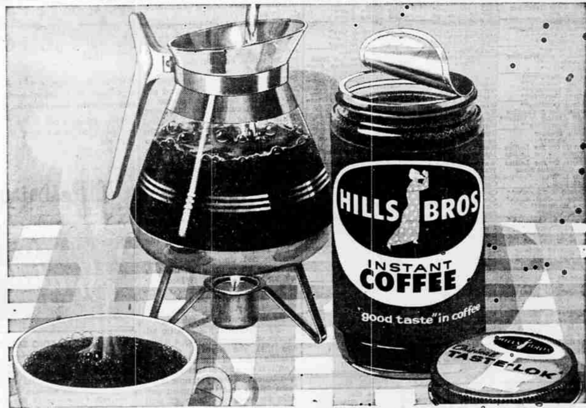
New aluminum inner-seal keeps taste in, keeps air out... Hills Bros. original TASTE-LOK