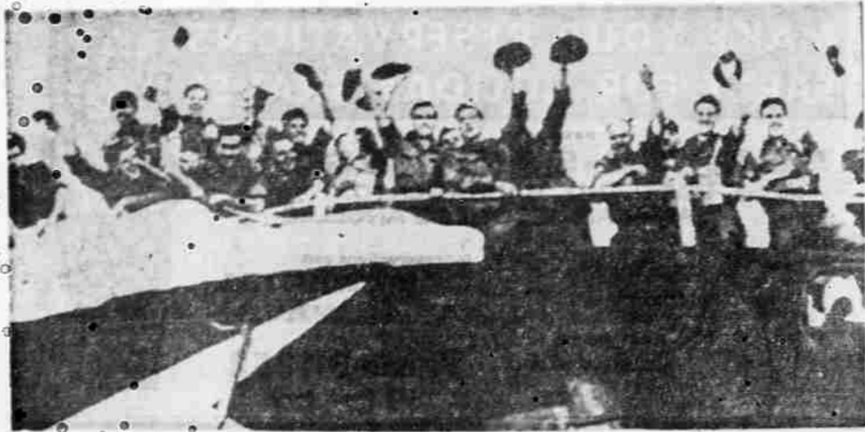
FAREWELL TO EGYPT —Jubilant British troops wave farewell as their transport leaves Port Said in first stage of Anglo-French withdrawal from Suez Canal area. A British Army announcement forbade troops to deal with Egyptians in Port Said as Egyptian civil authorities ordered a complete boycott.