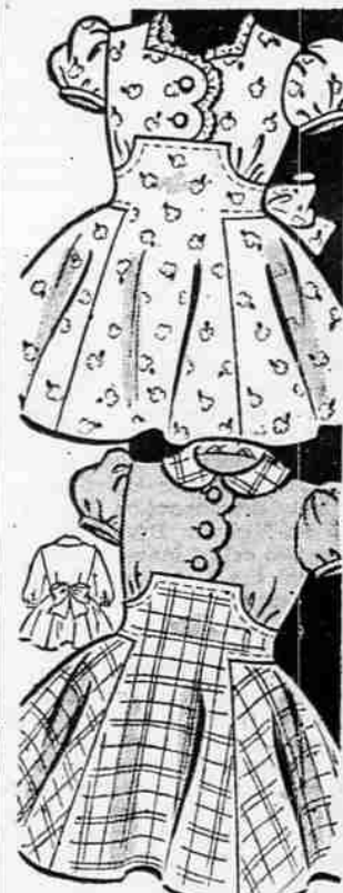
9315 2-10 by Marian Martin

Sew your cherub two new outfits — both from ONE pattern! Vary the neckline for party time or lesson-learning—the sleeves according to her whim! Use remnants—contrast fabrics and colors! She'll adore the high Empire effect, the full flare skirt!