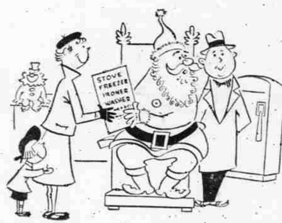
You'd Better Get Acquainted with the Finance Manager.

Manufacturers urge that particular attention be paid to instructions. For example, most of them point out that too much of any product interferes with proper washing, strains washing machine motors and is difficult to rinse out, leaving clothes dull looking and stiff feeling.