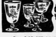
Reg. 2.95 SET OF 4 LIBBY STEMWARE Choice of 4 types. * NO MONEY DOWN *