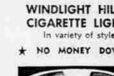
Reg. 2.95 Brass and Crystal Snack Server Makes attractive centerpiece. * NO MONEY DOWN *