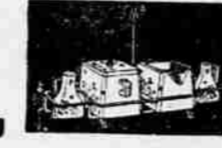
Reg. 2.95 Attractive SUGAR AND CREAMER And Salt and Pepper Set. * NO MONEY DOWN *