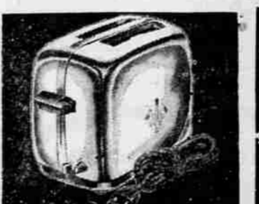
Reg. 12.95 Automatic FAMOUS BRAND 2-SLICE TOASTER

Attractive 5-tube set. Ideal gift for children's room. Lightweight, large tone, easy dial. 12 95 NO MONEY DOWN—ONLY 50¢ WEEK