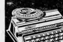
Reg. 3.95 Amazing Simplextoy Miniature Typewriter Types hours of fun. * NO MONEY DOWN *