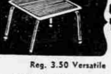
Reg. 3.50 Versatile METAL STEP STOOL Non-skid top and feet. * NO MONEY DOWN *