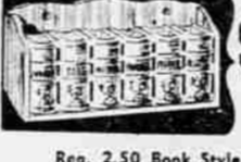
Reg. 2.50 Book Style IMPORTED SPICE SET Colorful. Mahogany rack. * NO MONEY DOWN *