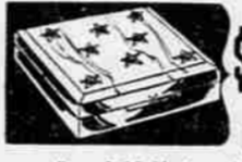
Reg. 1.95 Variety of LADIES COMPACTS Decorated, plain, your choice. * NO MONEY DOWN *