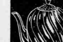
REG. 1.95 COLORFUL CERAMIC DESIGN TEA POT Choice of 4 Styles * NO MONEY DOWN *