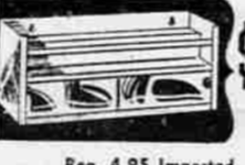
Reg. 4.95 Imported Metal Condiment Chest Has sliding mirror doors. * NO MONEY DOWN *