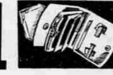
Reg. 1.95 Assorted LADIES JACKPOT PURSE New styles and colors. * NO MONEY DOWN *