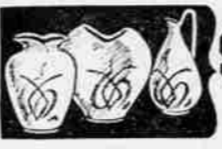
Reg. 2.79 Assorted GERMAN POTTERY Unique new gift pieces. * NO MONEY DOWN *