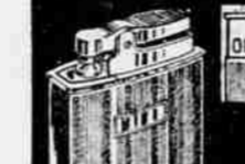
REG. 2.95 WINDLIGHT HILTON CIGARETTE LIGHTER In variety of styles. * NO MONEY DOWN *