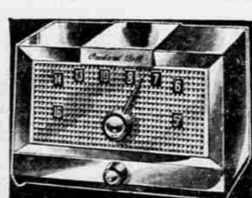
Lowest Price Ever! PACKARD-BELL TABLE RADIO

Service for six. Won't tarnish, stain or fade. A very practical gift at a low low cost. 4 88 NO MONEY DOWN—ONLY 25¢ WEEK