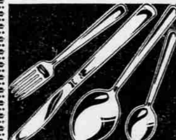
Reg. 9.95 24-PIECE STAINLESS STEEL TABLEWARE SET

Service for six. Won't tarnish, stain or fade. A very practical gift at a low low cost. 4 88 NO MONEY DOWN—ONLY 25¢ WEEK