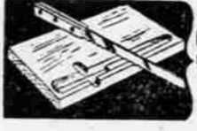
Reg. 2.95 Hardwood CARVING BOARD SET With fine serrated knife. * NO MONEY DOWN *