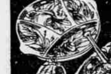
Reg. 2.95 RELISH DISHES ITALIAN IMPORT Your choice of styles. * NO MONEY DOWN *