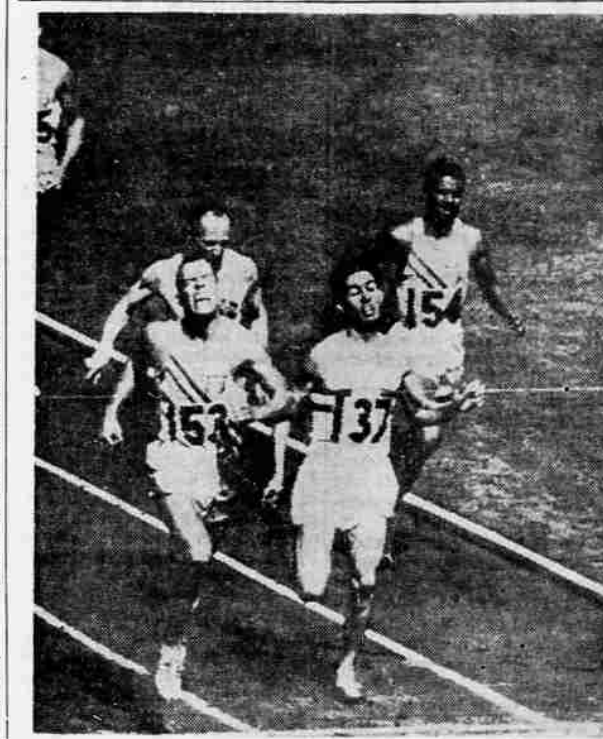
PHOTO FINISH—Tom Courtney (153) hits the tape slightly ahead of Britain's Derek Johnson (137) to win the 800-meter run of the Olympic Games in Melbourne. Partly hidden behind Courtney is Auden Boysen of Norway who took third place ahead of Arnie Sowell (154) of the U. S. Courtney's time was 1:47.7.