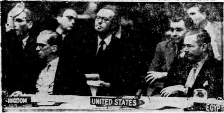
RAISING HAND DURING UN Security Council vote, Sir Pierson Dixon (left) vetoes a United States resolution calling for cease-fire in Egypt. Henry Cabot Lodge (right), looks on grimly. It is the first time in UN history that Britain vetoed a United States proposal. Move came as Israeli-Egypt fighting continued.