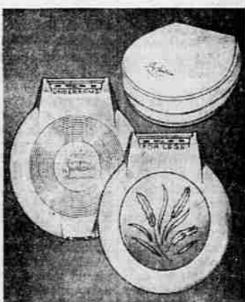
Sunbeam Lady SHAVEMASTER

Shaves closer and smoother than blades or other electric shavers by actual independent tests. Has new, scientifically precision honed Golden Glide head and faster, armature-type REAL motor. Available in handsome carrying case (shown) that can be used for a wall cradle holder. Also available in a genuine leather zipper case.