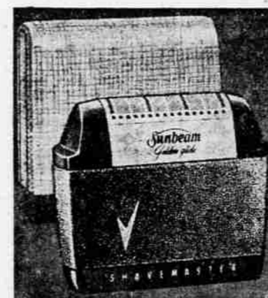
Sunbeam Golden glide SHAVEMASTER

Foods taste so much better when prepared in the Sunbeam Controlled Heat Automatic Frypan! Easy-to-set dial on handle gives perfect controlled heat for cooking or frying. Handy fry-guide gives correct temperatures—Easy to wash, water-sealed element. Square shape cooks 20% more. Available in medium, large, and super sizes to meet your family needs. High dome covers of either aluminum or heat-resistant glass are available for fried chicken, roasts, etc.