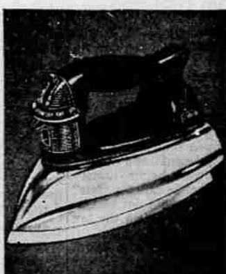
Sunbeam STEAM OR DRY IRON

COFFEEMASTER —You get the same delicious cup of coffee every time! Just put in coffee and water and set the switch on high—the rest is done automatically. PERCOLATOR —Finest made. Has Easy-to-set strength selector dial. Available in 8 and 10-cup sizes. Both the COFFEEMASTER and the Percolator are made of solid copper and heavy nickel and chrome plated for lasting beauty.