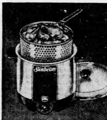
Sunbeam COOKER & DEEP FRYER

The only completely automatic toaster. Toasts with RADIANT CONTROL—adjusts automatically for any kind of bread—whether thick or thin, fresh or frozen, white or rye. Bread lowers itself automatically. No levers to push. No motor to wear out. Selector control for any kind of toast you desire.