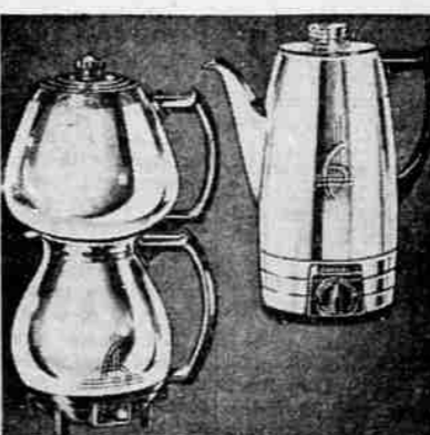
Sunbeam COFFEEMASTER & PERCOLATOR

Does More Things Better—Automatically. It's a DEEP FRYER • COOKER • CHAFING DISH • CASSEROLE STEAMER • BUN WARMER • CORN POPPER • BLANCHER FOR VEGETABLES FOR HOME FREEZING • ALL IN ONE. Exclusive COOK-GUIDE. Accurate thermostatic controls with SUMMER RANGE.