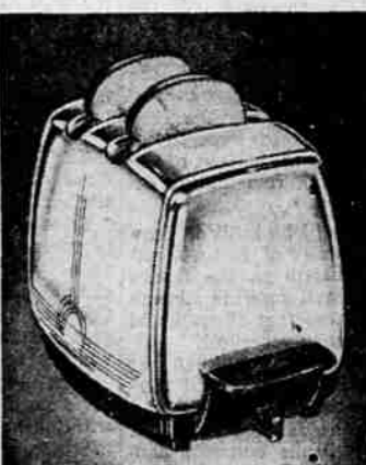
Sunbeam AUTOMATIC TOASTER

Sweeping America! Only the Lady Sunbeam has the easy-to-use "compact" shape and the exclusive MICRO-TWIN head—one side for shaving underarms, the other side for shaving legs close, clean and smooth. Available in 6 beautiful colors.