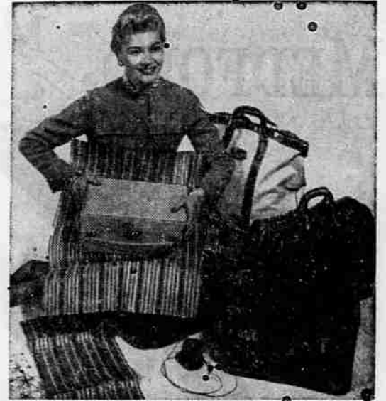
EVERYONE ON YOUR gift list has a special kind of luggage which makes travel more fun. The fitted vanity case for a teen-ager's cosmetics will go to many a party and end. The oversize duffel bag is perfect for a commuting friend; the center chub bag with a built-in brief case in the bottom is a gift idea for executives and the train case idea for any girl.

The choice of travel gifts is as wide as the number of places one might visit... you'll find something for every person on your gift list!