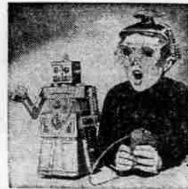
HE WALKS, TALKS and his eyes light up—for he's Robert the Robot; the amazing remote-controlled mechanical man. Made of high-impact plastic, he can pick-up objects, light up the antenna on his head, as well as move about. A recording in his body recites "I am Robert Robot, the mechanical man. Drive me and steer me, wherever you can."