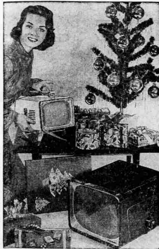
TELEVISION FOR CHRISTMAS—Two of the latest models in carry-around sets. The "Personal" model (shown on the table) provides thirty-six square inches of viewable picture and the "Sportster" which offers 108 square inches of tele-viewing.

More than 150-foot carloads of trees go out of this community each year to brighten homes everywhere.