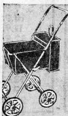
DOLLYS STROLLER Dolly goes to market in Penney's light-weight shopping stroller! Shopping bag detaches, slips over Missy's arm! Steel construction. Folds for toy-box storage!