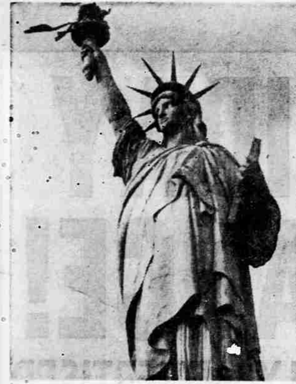
FLAGS FLY FROM STATUE —A Hungarian flag, trailing a black mourning band, and an American flag wave from torch of the Statue of Liberty after several men broke two locks and gained entrance into the monument. Both flags, about five feet by twenty in size, flew for about ten minutes before officials took them down.