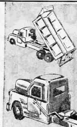
Penney's solid steel, hydraulically operated dump truck! Almost 21 inches long! Ten rubber wheels! Great colors!