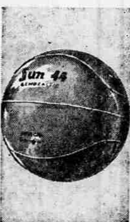
Official size! Official weight! Penney's pebble grained rubber basketball. Self sealing valve. Needle included.