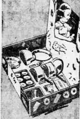
24 Only So much for so little! Penney's aluminum cook and bake set. 3 piece double boiler! Whistling tea-kettle, cake and muffin tins, cookie sheets and everything for the mixing!