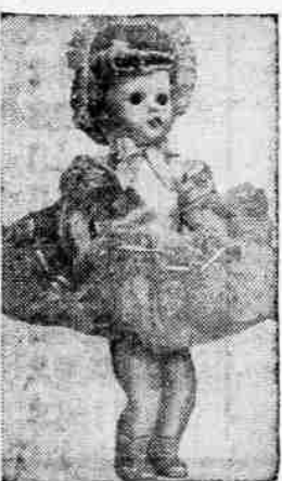
A favorite guest at little tea parties! Penney's 21 inch vinyl party doll! With all position arms, legs, cooing voice, winking eyes ... long low eyelashes!