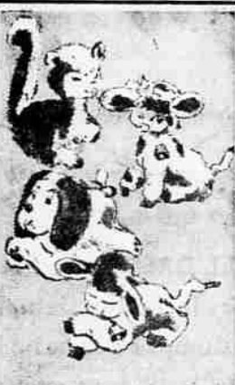
Penney's barnyard pets! Thoroughbred cows 'n dogs. All in take-it-to-bed rayon plush! A tremendous value at a Penney-low price!

Penney's strong, sturdy, easy-to-play 3-speed portable phonograph. Great buy for only $20. Wood frame case, plastic covered. Iron stand with 39 record rack. AC. SPECIAL 20.00