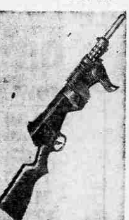
Shoots sparks! Goes rat-tat-tat! Penney's battery operated sub-machine gun. 24 inches long. Sturdy plastic.