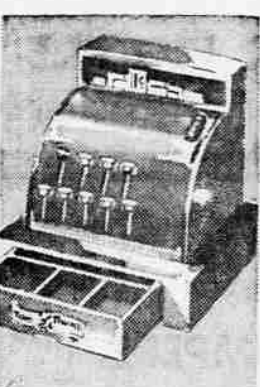
12 Only Ring ting goes the register! Junior is a big financier with 9-key steel cash register. Bell rings when drawer opens. 7 1/2 inches high, 6 1/2 inches wide.