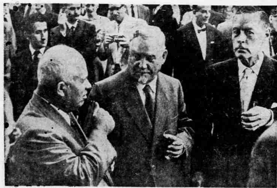
NEW RUSS TIRADE—U. S. Ambassador to the USSR Charles E. Bohlen (right), shown here with Red party chief Nikita Khrushchev (left) and Soviet Premier Nikolai Bulganin, walked out on Khrushchev for second straight day when the Russian leader launched a bitter attack on the Western powers. Photo was taken at July fourth reception at Bohlen's residence in Moscow.