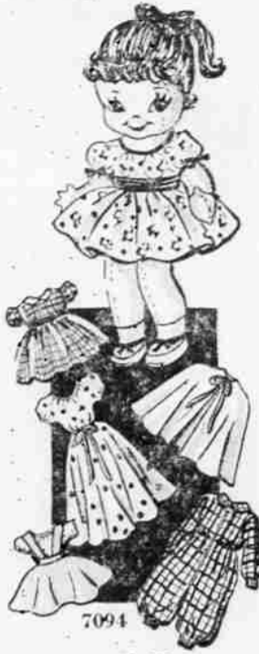
7094 by Alice Brooks

Adorable 9-inch doll! Complete 10 - garment wardrobe! Thrill your daughter with this wonderful doll!