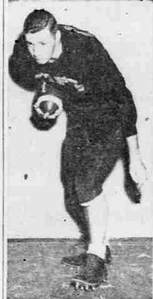
JUVELAND Crater All-Star Back