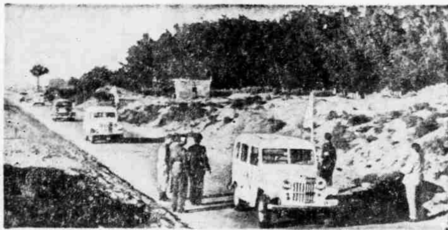
FLYING WHITE FLAGS, painted white, United Nations jeeps carry truce observers along "No Man's Land" in Suez Canal zone as hostilities end.