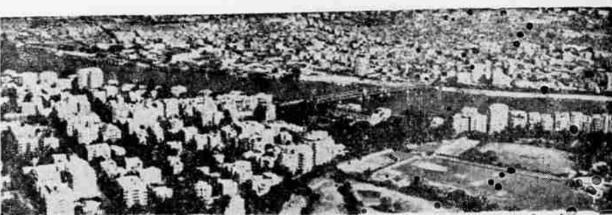
FLYING FROM CYPRUS , British jet bombers drop high explosive, incendiary bombs on Egyptian military installations in Cairo and Suez Canal area. This is air view of Cairo where Premier Nasser announces 'resistance to death.'

The Bruins chalked up their seventh straight win Thursday night, jumping on the hapless Chicago Black Hawks for a 5-3 win. Meanwhile, the second-place Red Wings who trail the Bruins by only one point, downed the Toronto Maple Leafs 4-2.