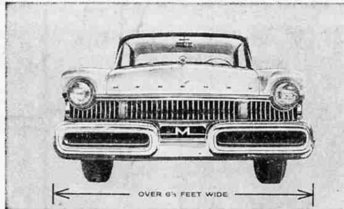
NEW WIDTH —Notice how the Big M's new breadth is dramatized by a massive new Jet-Flo Bumper. The oval shape of this graceful new bumper design is as functional as it is beautiful. It acts as a double bumper—provides both high and low protection. Notice the matching "twin"-styled rear bumper (right).

Look how much the Big M has grown for 1957—in size, power, weight—in everything that counts in a car!