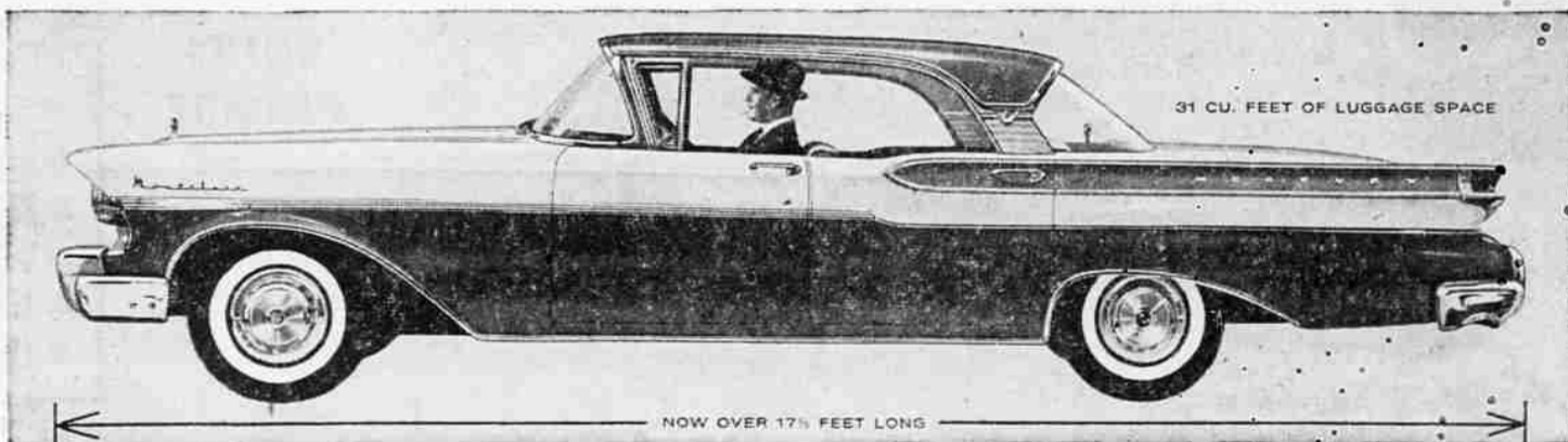
NEW LENGTH, NEW WHEELBASE —CLOSE TO TWO-TONS BIG. Every important dimension is bigger. In addition to the new length, wheelbase is a big 122 inches. And the 1957 Mercurys are up to 225 pounds heavier, too. A far lower center of gravity gives you an amazing sense of "nailed-down" stability on curves and corners.