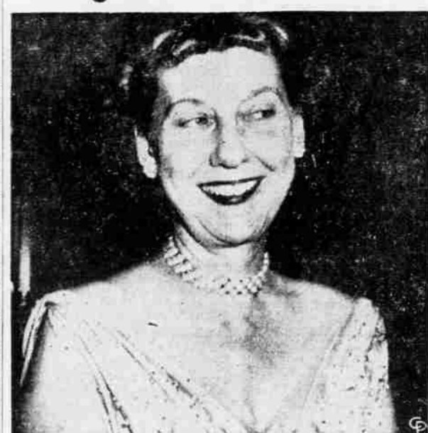
MAMIE EISENHOWER Life in White House Agrees With Her