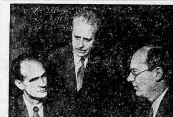
HONORING TRANSISTOR RESEARCH, Swedish Academy of Science announces 1956 Nobel Prize for Physics will be shared by three Americans. From left: Dr. William Shockley, Stanford University lecturer; Dr. Walter H. Brattain and Dr. John Bardeen.

of Gomulka. Both Spychalski and Gomulka were once disgraced for "Titoism" and, only recently rehabilitated. Rokossovsky's resignation had been predicted for weeks—ever since Gomulka resumed power. But the 60-year-old marshal, twice a hero of the Soviet Union, remained in his post as defense minister until Tuesday as a concession to Moscow. To Ask Intentions Informed circles said Gomulka and Cyrankiewicz would leave for Moscow Thursday or within the next few days. They were expected to ask about Russian intentions toward Poland. The Poles have shown more sympathy with the Hungarians than have any other East European countries, but Gomulka and other Communist leaders have tried to restrain public feeling to prevent a repetition here of the Soviet move in Hungary.