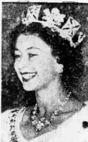
DRIVING to House of Lords for opening of Parliament, Queen Elizabeth II smiles happily as subjects cheer along route.