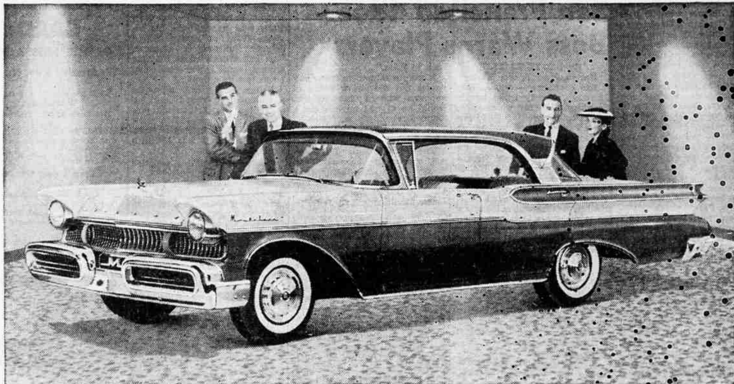
MOST ADVANCED DESIGN IN CARS... Gone is the plump look of most other cars. Bulging curves have given way to bold, clean-cut lines. And there's new power to match—up to 290 horsepower!