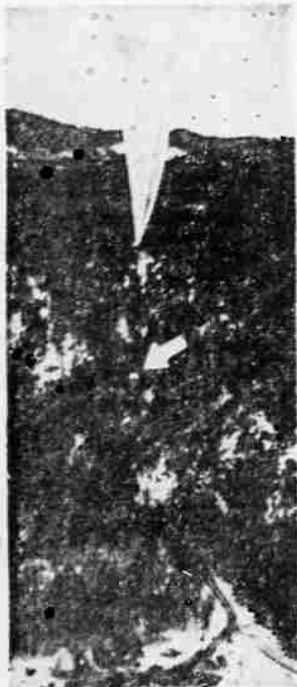
RECORD CLIMB —Suspended from a 125-foot high balloon, the Navy's Strato-Lab (arrow), carrying two Navy officers, rises from the Strato-Bowl near Rapid City, S. D. on its way to record-breaking altitude of 78,000 feet. The balloon then went out of control, dropping at great speed, but the two pilots managed to land the gondola safely near Kennedy, Neb.