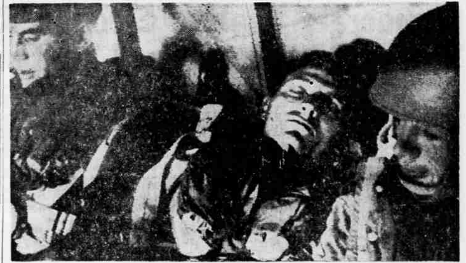
BRITAIN ENDS WAR—A British paratrooper takes a cat-nap inside plane on way to drop troops near Port Said, Egypt. As fighting raged around the Port Said area, Britain officially informed the United Nations that Allied forces were ending hostilities in the Middle East.

FOR SELECTION—FOR QUALITY—FOR SERVICE—FOR MONEY SAVING VALUES SHOP GROCETERIA.