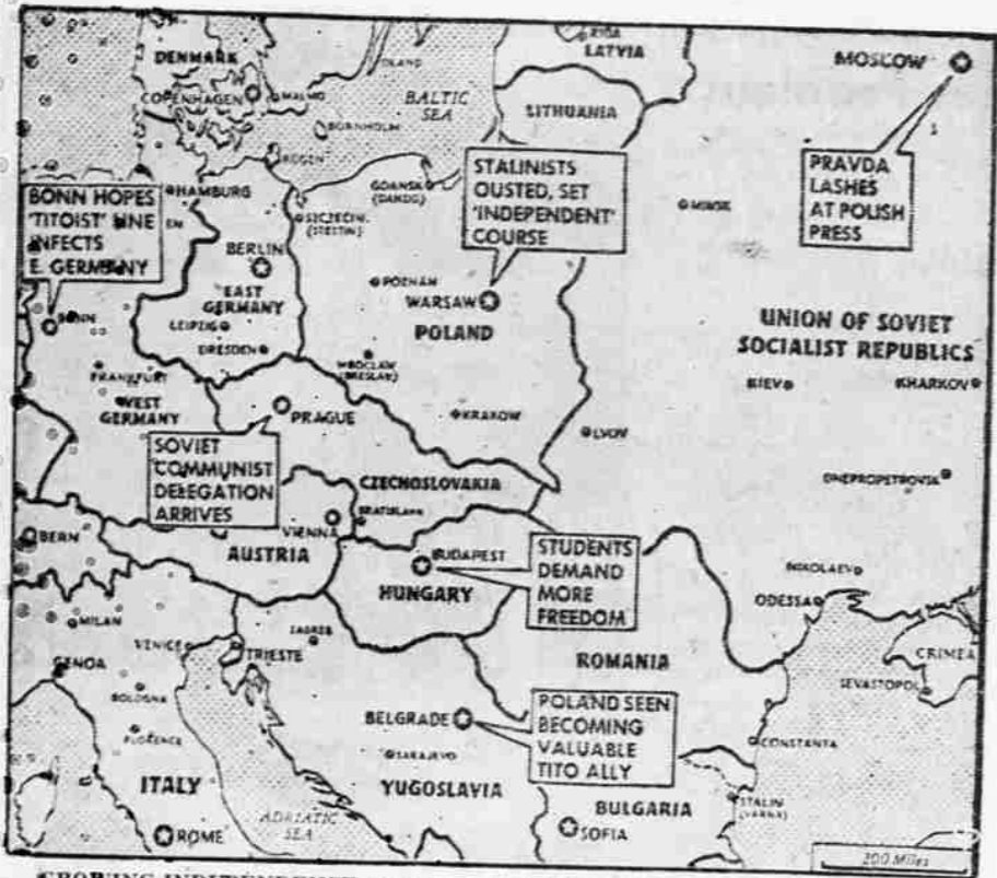
GROWING INDEPENDENCE movements in satellite nations provide king-size headaches for Soviet Russia's leaders. Poland is launched on road independent of Moscow and similar defections are expected in Hungary and East Germany. Only Czechoslovakia so far has given no outward signs of restlessness.