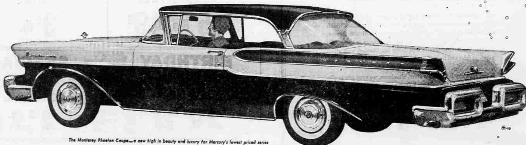
The Monterey Phaeton Coupe—a new high in beauty and luxury for Mercury's lowest priced series

Everything that counts in a car has been changed dramatically! Mercury for '57 presents: Dream-Car Design · Biggest size increase in the industry · Exclusive Floating Ride · New Keyboard Automatic Transmission Control · New 255 and 290 hp V-8 engines · Exclusive Power-Booster Fan · Dream-Car features everywhere you look. Stop in—see how The Big M outdates them all.