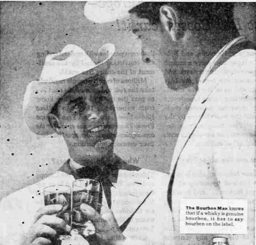
The Bourbon Man knows that if a whisky is genuine bourbon, it has to say bourbon on the label.

Here's to you, brother, if you're a Bourbon Man