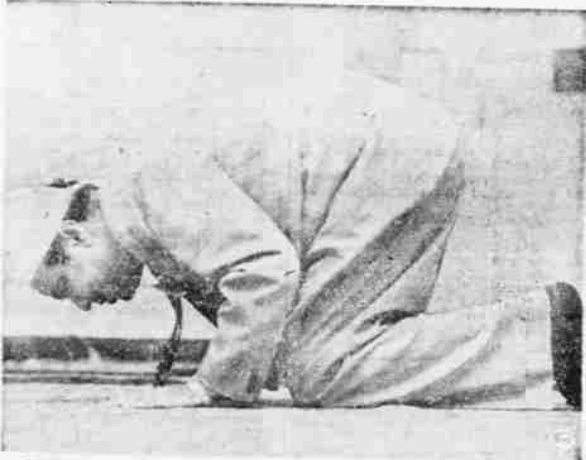
KNEELING WITH HIS FACE TO MECCA and praying for peace is Pakistan's ambassador to the United States, Mohammed Ali, in a Washington, D. C., mosque.

The agreement, reached Monday, provides that seamen will receive $10 a day extra in the danger zone. Each crew member will receive $150 if his ship is destroyed or damaged as a result of the hostilities. Seamen will also be covered by $10,000 war risk insurance while in the danger zone.