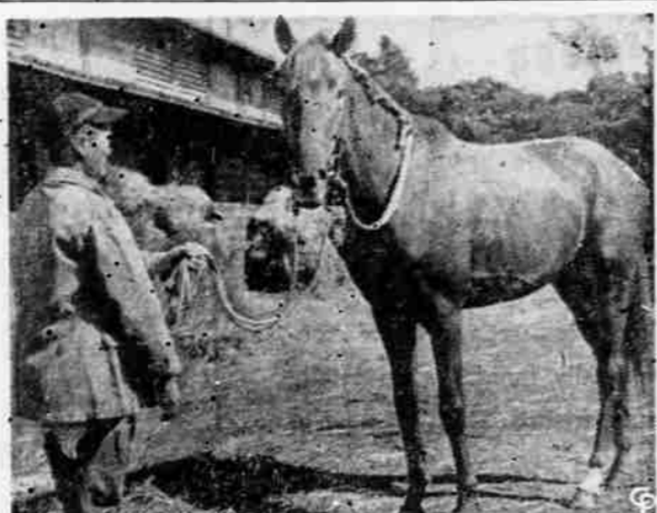
CARRYING HOPES OF JAPAN, Sekai-O is to be flown 11,000 miles from Tokyo to Laurel, Md., to compete in $100,000 Washington International November 12. Horse won five out of 10 starts this year.