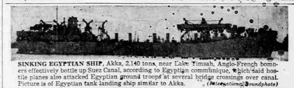
SINKING EGYPTIAN SHIP, Akka, 2,140 tons, near Lake Timsah, Anglo-French bombers effectively bottle up Suez Canal, according to Egyptian communique, which said hostile planes also attacked Egyptian ground troops at several bridge crossings over canal. Picture is of Egyptian tank landing ship similar to Akka.

San Francisco offers ships from all parts of the world 18 miles of piers and berthings, some deep enough for the largest vessels afloat.