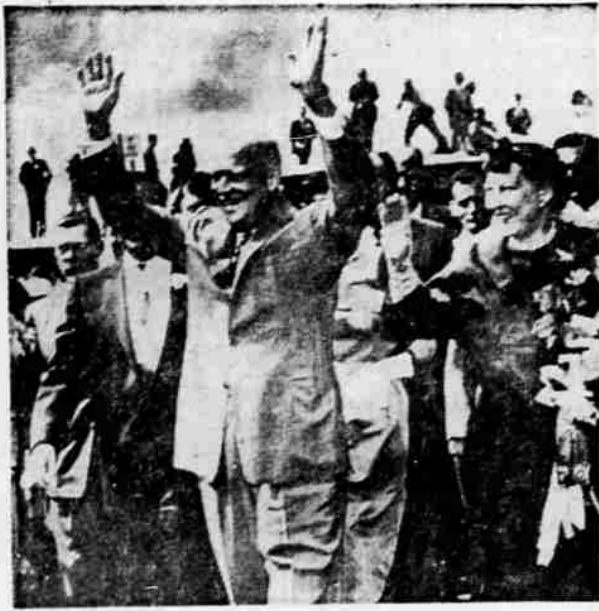
PRESIDENTIAL RESPONSE —President Eisenhower responds to crowd's greeting at airport in Miami, Fla., where 4000 people gathered to hear the chief executive make a 30 minute "prop-stop" campaign speech. Mrs. Eisenhower waves at right.