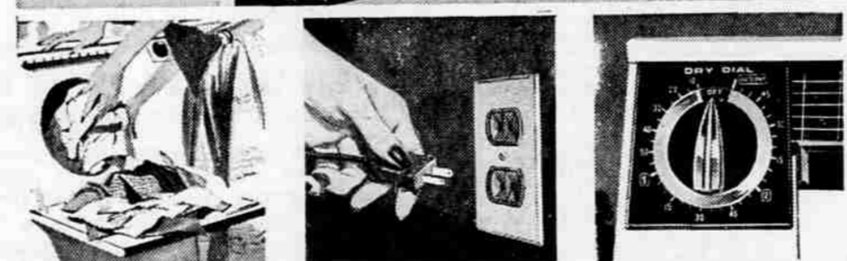
Look-in Loading Door. Ends stooping, reaching, bending; no kneeling to load or unload; you do all loading and unloading from a standing position. Plugs in anywhere! Operates on whatever current you have, just like the Laundromat! Lint-filter conveniently set in top panel or you may vent to outdoors easily. Automatic Dry Dial. Not just a timer... shuts off automatically when clothes are dry. Built-in Laundrogide gives complete directions. Heat Selector dial gives proper heat zone for all fabrics.

All have Direct Air Flow Drying. Each has an Identical Laundromat Twin