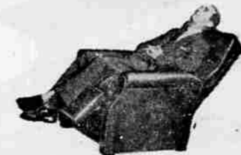
For that just-before-dinner few minutes of rest, and for T-V viewing.