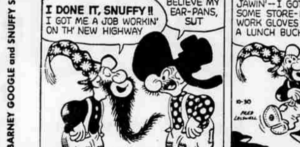
BARNEY GOOGLE and SNUFFY SMITH