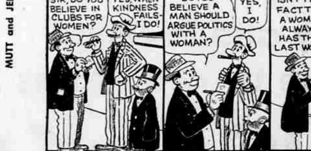
MUTT and JEFF