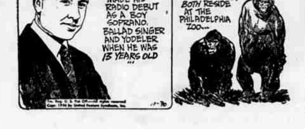
GEORGE GOBEL MADE HIS RADIO DEBUT AS A BOY SOPRANO, BALLAD SINGER AND TODELER WHEN HE WAS 13 YEARS OLD.