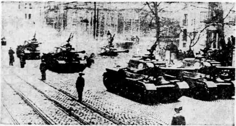
TURNS INTO THE REAL THING —Russian troops, tanks and heavy armored cars ranged through Budapest streets echoing with machine gun and rifle fire, first eyewitnesses to reach the West from revolt-torn Hungary reported. Here tanks rumble through a Budapest street during a Hungarian national holiday in 1952.