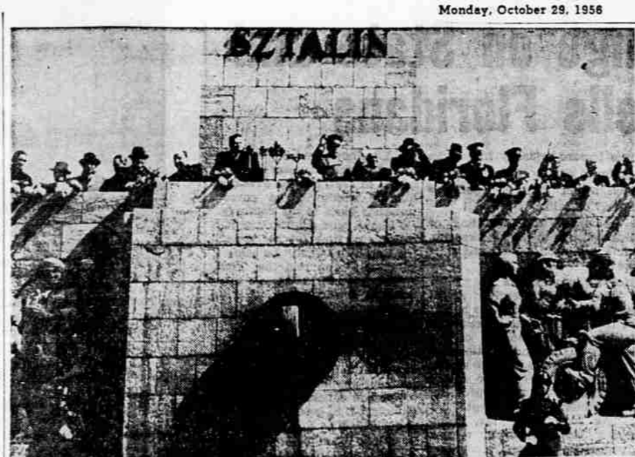
TARGET —The huge Stalin monument in Budapest, capital of Hungary, shown above in 1955 as a group of high-ranking Soviet and Hungarian Communist leaders attended ceremonies there, was the prime target of demonstrators as thousands of Hungarians demanded the ouster of Russian troops from the country. Budapest radio broadcast a special announcement defending the presence of Russian troops on Hungarian soil, saying that "Soviet troops have responded to the request of our government."