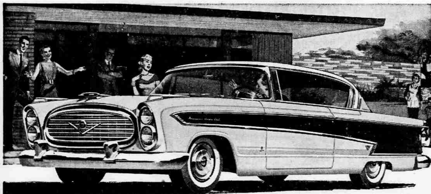
PRODUCT OF AMERICAN MOTORS

WHILE other prices go up—Nash prices go down. Nash power goes up—now 255 HP in the big, new long-wheelbase Nash Ambassador for 1957.