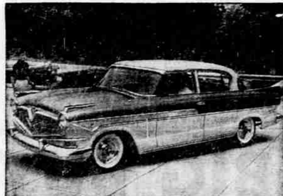
HUDSON ON DISPLAY —The 1957 Hudson Hornet is on display today at Stevens Auto Sales, Inc., 505 North Central ave., Medford. The Hornet will be available in V-8 series, two inches lower in height, with a 255-horsepower V-8 engine. Shown above is the new Hornet four-door sedan available in super and custom two-door "Hollywood" hardtop. Styling modifications include new rear fender fins, dual-fin front ornaments, silver textured aluminum panels on custom models, and new 14-inch wheels.