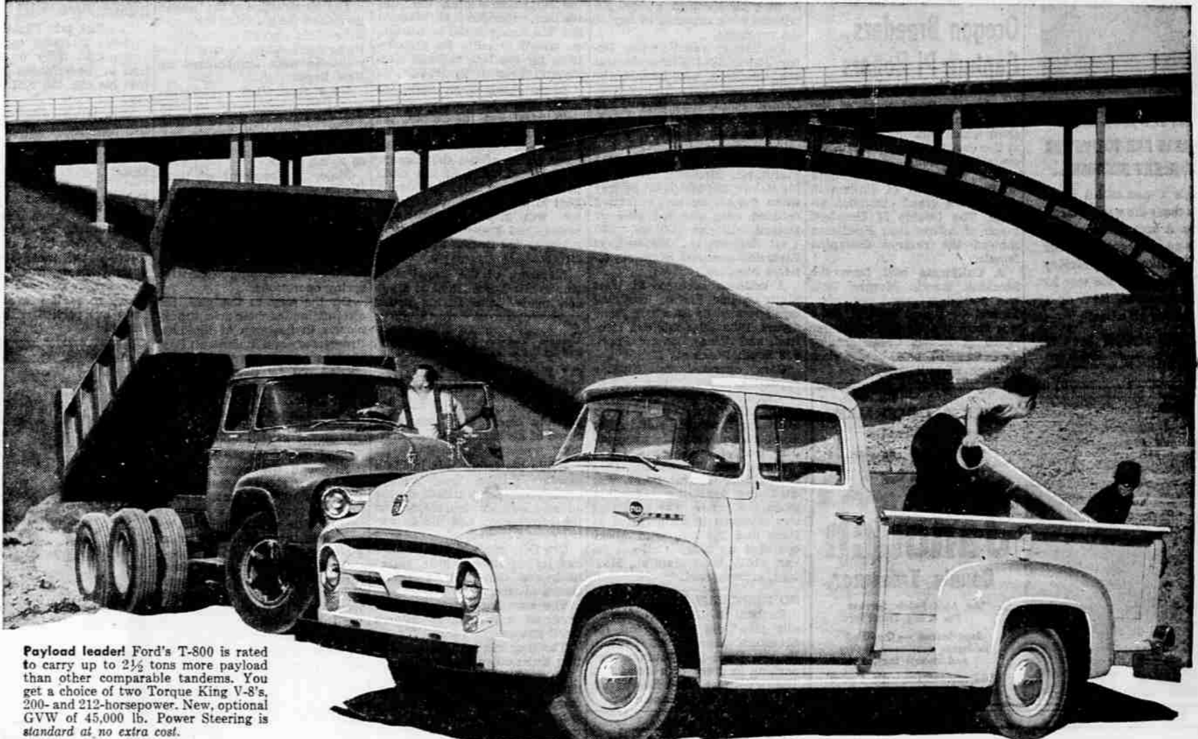
Payload leader! Ford's T-800 is rated to carry up to 2½ tons more payload than other comparable tandems. You get a choice of two Torque King V-8's, 200- and 212-horsepower. New, optional GVW of 45,000 lb. Power Steering is standard at no extra cost.

JOHNSTON STORES 112 South Riverside B.F. Goodrich FIRST IN RUBBER—FIRST IN TUBELESS ALL 6-VOLT SIZES $12.95 3 YEAR Guarantee old battery TERMS