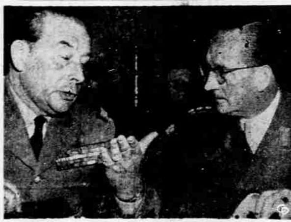
MEETING IN WASHINGTON, NATO military committee confers on problems of defending Western Europe. Gen. Jean E. Valluy (left), France, is emphasizing point in discussion with Lt. Gen. Hans Speidel, who heads German delegation to conference.

Poles fought the Germans underground, fiercely, throughout the war. Russia betrayed them by refusing to go to their aid. It is estimated that Poland lost between 6 million and 7 million of its 35 million people in war casualties and by German terror. Warsaw, the capital, was systematically destroyed.