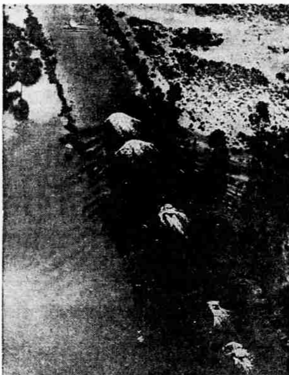
ANCHORS AWEIGH! —Giving a speedboat race effect, these automobiles cautiously feel their way along a highway at Lack Okeehobee, Fla. after storm-born flood waters poured through central Florida. The Red Cross set up emergency disaster headquarters and work crews to divert the torrents of flood water, heaviest in the area since the 1948 hurricane.