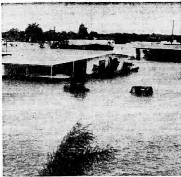
DROUGHT ENDS WITH DELUGE —Torrential downpour from a small tropical storm dumped up to 15 inches of rain on central Florida and caused some 200 families to flee their homes here in Kissimmee. Damage was estimated in excess of two million dollars. Although some crops were damaged by water, most of the area's growers welcomed the end of a two-year-long drought.

The FBI says more than one million cars, valued at over one billion dollars have been stolen in the past five years.