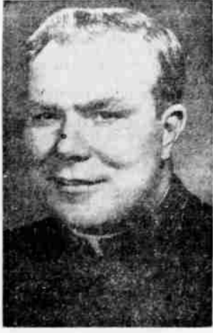
Father Patrick Peyton