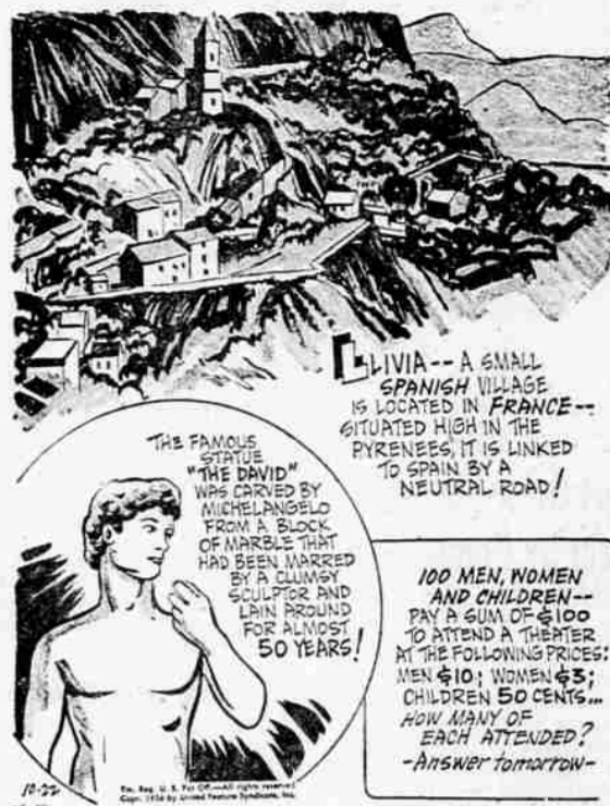
LIVIA--A SMALL SPANISH VILLAGE-- IS LOCATED HIGH IN THE PYRENEES. IT IS LINKED TO SPAIN BY A NEUTRAL ROAD!