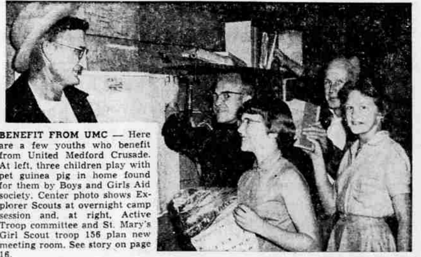
BENEFIT FROM UMC — Here are a few youths who benefit from United Methodist Crusade. At left, three children play with pet guinea pig in home found for them by Boys and Girls Aid society. Center photo shows Explorer Scouts at overnight camp session and, at right, Active Troop committee and St. Mary's Girl Scout troop 156 plan new meeting room. See story on page 16.