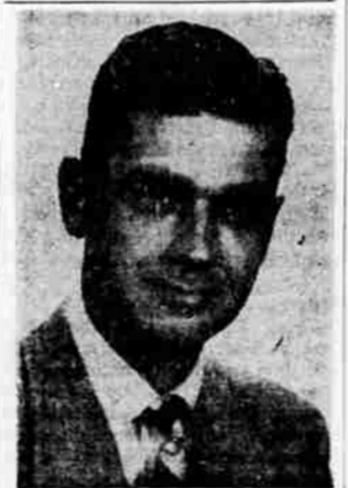
SEN. MARK HATFIELD To Speak Here

"This means that every student and parent should realize the necessity of doing their best to assure the student's having a later opportunity to enter college," the letter stated. It continued: "This emphasis assumes new meaning at the ninth grade level and should definitely continue throughout high school."