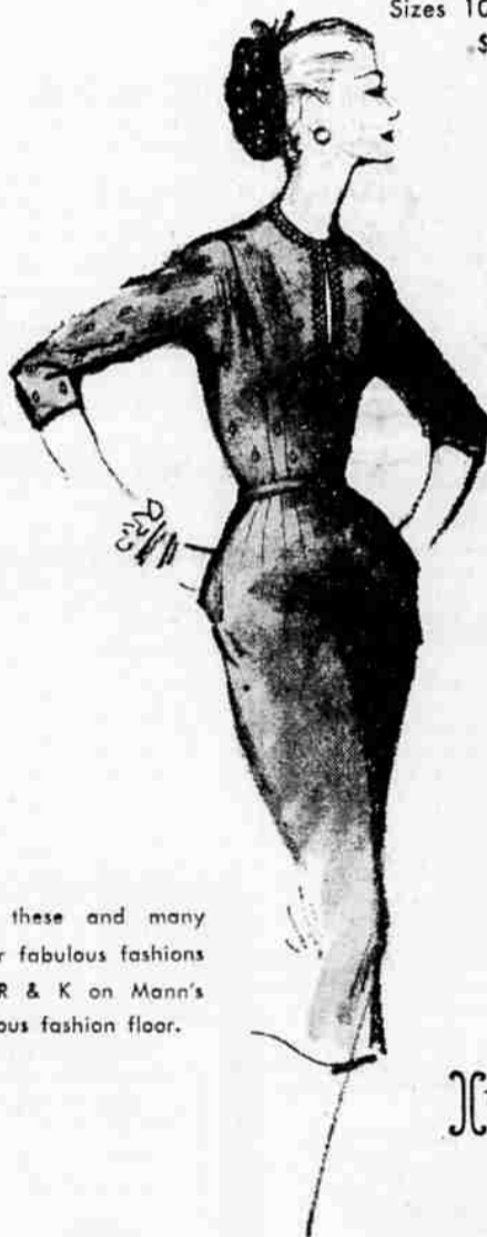
See these and many other fabulous fashions by R & K on Mann's famous fashion floor.

see it demonstrated on our main floor Monday and Tuesday . . .