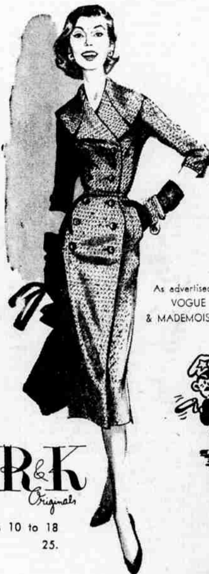
As advertised in VOGUE & MADEMOISELLE