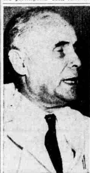
WINS PRIZE —French-born Dr. Andre Cournand, 61, (above) of Columbia University is one of three doctors jointly awarded the 1956 Nobel Prize for Medicine at Stockholm, Sweden.

A report of the returns and recommendations for further study will be made at the Oct. 25 meeting in the conference room at the courthouse annex at noon. Residents of Jackson interested have been invited. Coffee is provided to go with the participants' sack lunches.