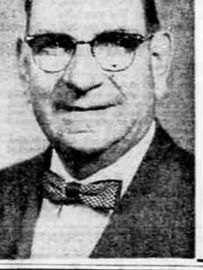
REV. ORAL ROBERTS

Junior High young people in the vicinity of Hedrick Junior High school are invited to attend.