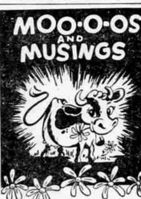
An economic survey reveals that it costs 10 times as much a year to feed a child as it does a pig.