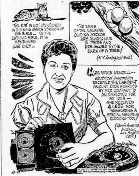
THE CAT IS NOT MENTIONED IN THE BIBLE... IN THE MALAYAN GLIDING BECKOS ARE ALWAYS LAID IN PILES AND ARE GLUED TO THE BARK OF A TREE! (N.Y. Zoological Soc.)